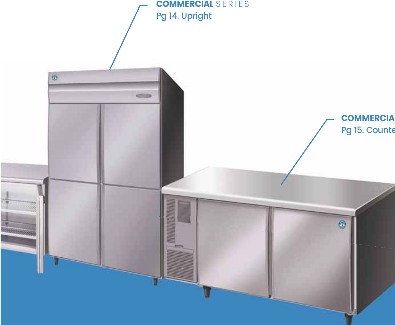
COMMERCIAL SERIES Pg 15. Counter