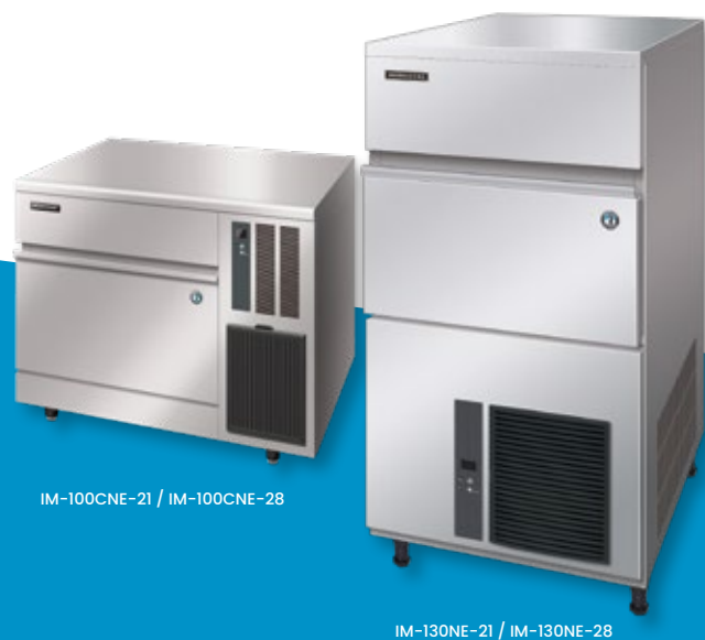
IM-100CNE-21 / IM-100CNE-28