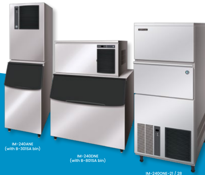
IM-240ANE (with B-30ISA bin)